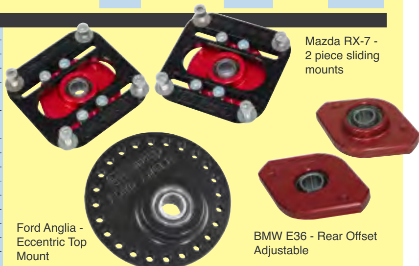
Ford Anglia - Eccentric Top Mount