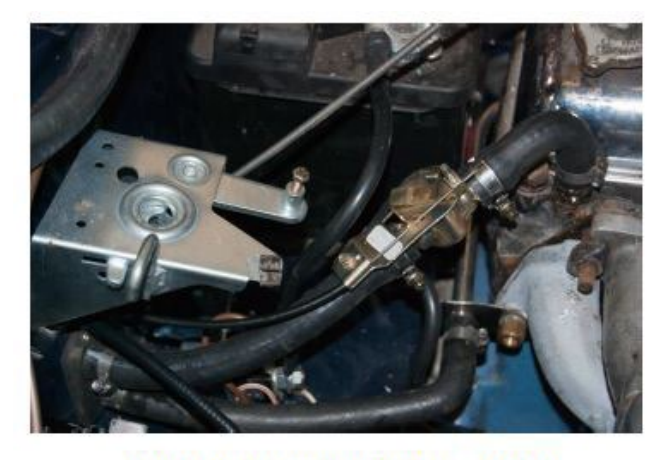
Figure 6: Valve installed in a TR4A