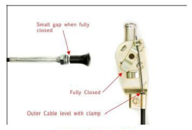
Figure 4: Valve Setting